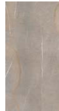
60x120 - 23 5 / 8 x47 1 / 4 02 MXM 12RT Grigio Rettificato 1075

cm. 60x120 cm. 20x120 cm. 60x60 cm. 30x60 inch 23 5 / 8 x47 1 / 4 inch 7 7 / 8 x47 1 / 4 inch 3 15 / 16 x23 5 / 8 inch 11 13 / 16 x23 5 / 8