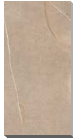
60x120 - 23 5 / 8 x47 1 / 4 01 MXM 462R Sand 20MM Rettificato 1125