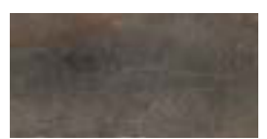
30x60 - 11 13 / 16 x23 5 / 8 MXM 66RT Dark Brown Rett. 1040 07