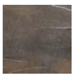
60x60 - 23 5 / 8 x23 5 / 8 MXM 60RT Dark Brown Rett. 1065 03