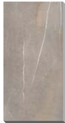
60x120 - 23 5 / 8 x47 1 / 4 MXM 162R Grigio 20MM Rettificato