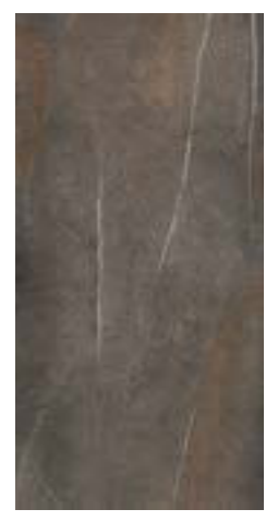
60x120 - 23 5 / 8 x47 1 / 4 MXM 62RT Dark Brown Rett. 1075 02