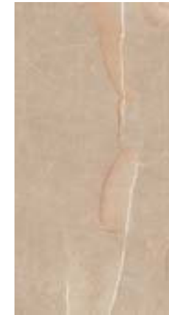
60x120 - 23 5 / 8 x47 1 / 4 02 MXM 42RT Sand Rettificato 1075

cm. 60x120 cm. 20x120 cm. 60x60 cm. 30x60 inch 23 5 / 8 x47 1 / 4 inch 7 7 / 8 x47 1 / 4 inch 3 15 / 16 x23 5 / 8 inch 11 13 / 16 x23 5 / 8