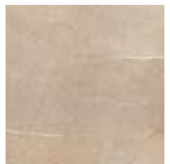
60x60 - 23 5 / 8 x23 5 / 8 03 MXM 40RT Sand Rett. 1065