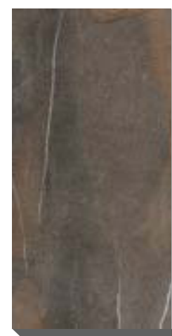
60x120 - 23 5 / 8 x47 1 / 4 MXM 262R Dark Brown 20MM Rett. 1125 01