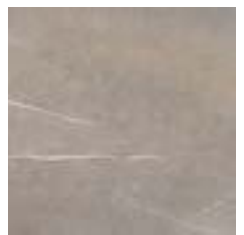
60x60 - 23 5 / 8 x23 5 / 8 03 MXM 10RT Grigio Rett. 1065